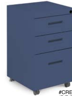
#CREN-A-2011-846-U (B/B/F - 18 7/8" D x 27 1/8" H)