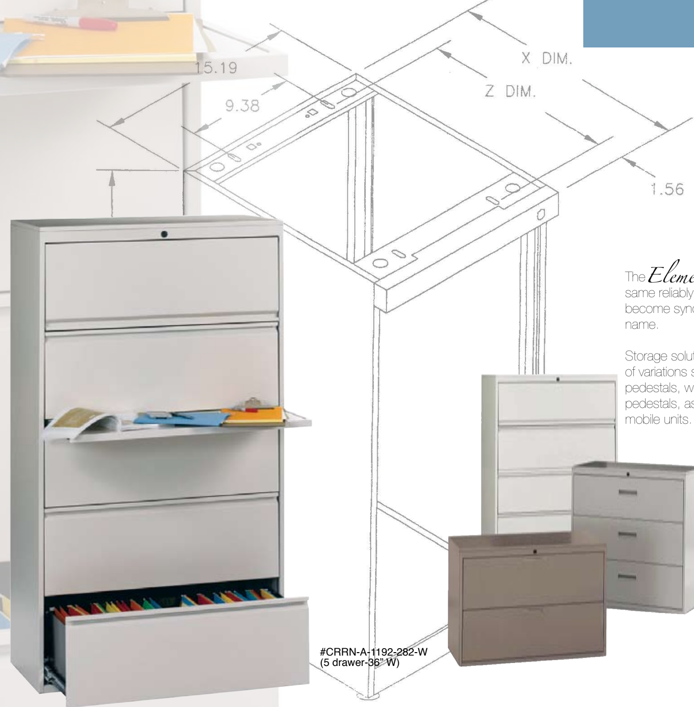
#CRRN-A-1192-282-W (5 drawer-36" W)

The 5 drawer unit can also be equipped with a posting shelf for a convenient, instant workspace and is available in 30", 36" and 42" wide.