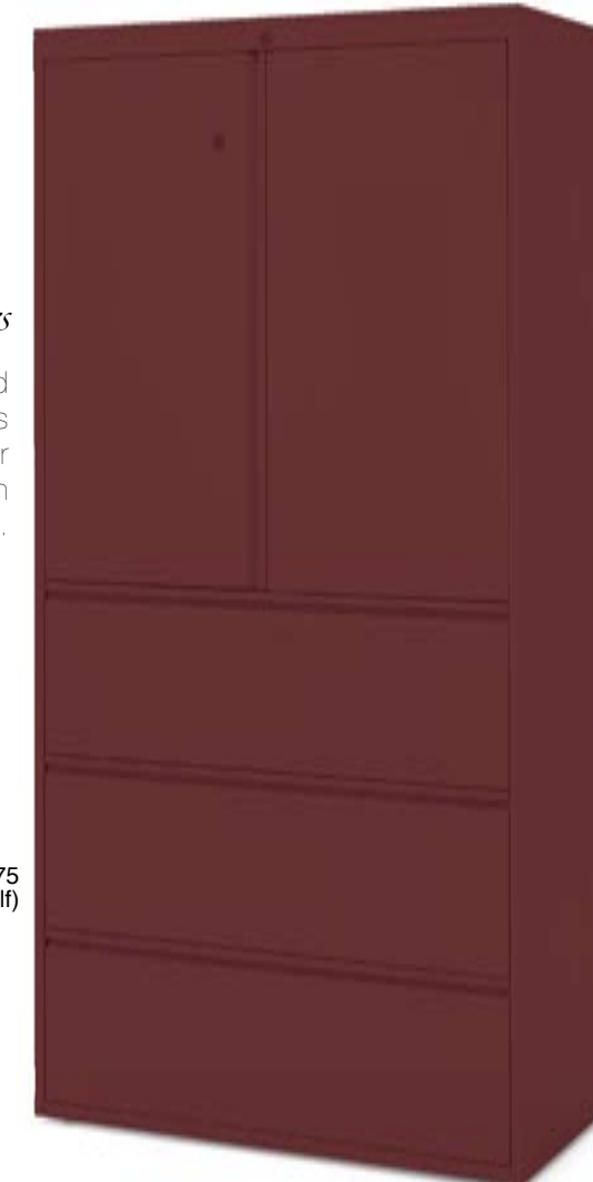
#CRRN-A-5897-675 (76 1/4" H x 36" W-1 Adjustable shelf)