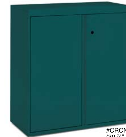
#CRCN-A-0230-529 (39 7/8" H x 36" W-1 Adjustable shelf)

are the ultimate storage solutions for busy teachers and administrators. CREST offers a variety of combinations including cupboard and wardrobe storage, mobile or fixed units, and is available in 2, 3, and 4 drawer models.